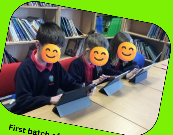
First batch of replacement iPads