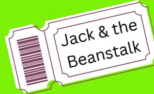
Extra Panto tickets for volunteers