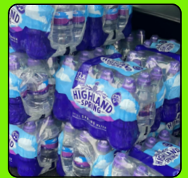
Bottled water for all children at the Panto