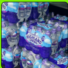
Bottled water and ice lollies for all children at the Panto