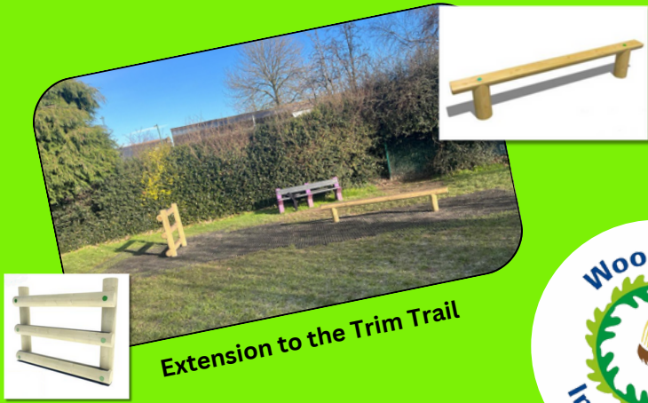
Extension to the Trim Trail