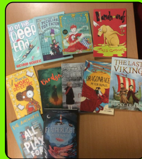
'Reading for All' books