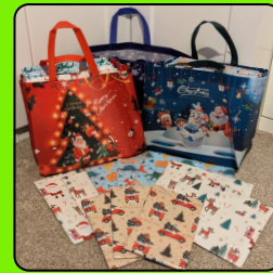
Books from Santa