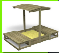
Grant funded sandpit in EYFS playground