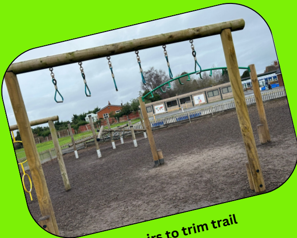
Repairs to trim trail