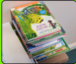
'Reading for Pleasure' books and cushions for the outdoor Book Nook